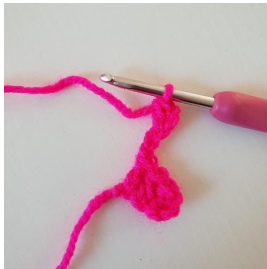
2. Hækl 1 stgm i tredje lm fra nålen