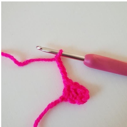
1. Lav 5 luftmasker