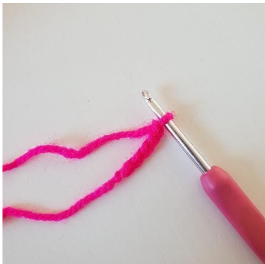
1. Start med at lave 5 luftmasker