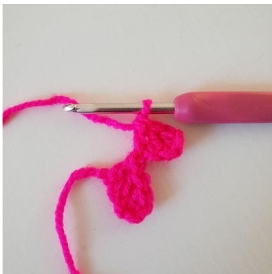
3. Hækl stgm i de næste 2 lm. Nu har du yderligere en pixel.