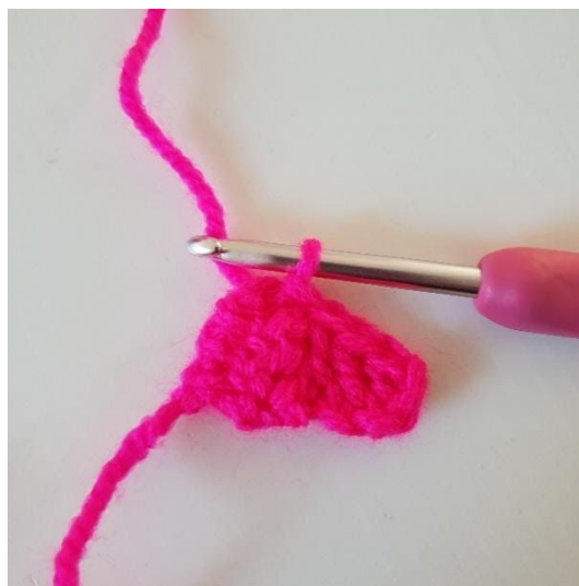
4. Nu skal pixlen hækles sammen med den første pixel. Dette gøres ved at vende pixlen og hækl 1 km i venstre side af den første pixel. På billedet kan du se de 2 sammenhæklede pixler.