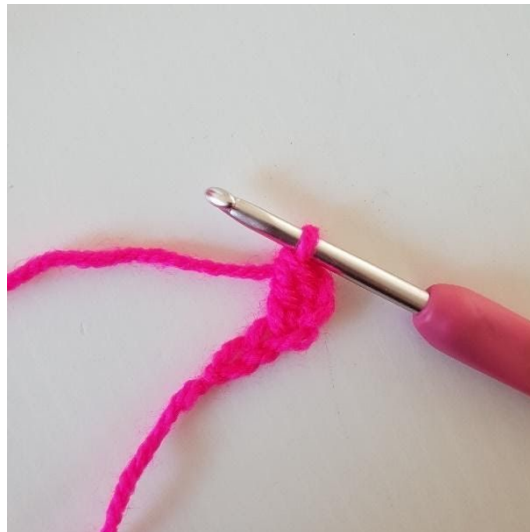
2. I 3. luftmaske hækles 1 stangmaske