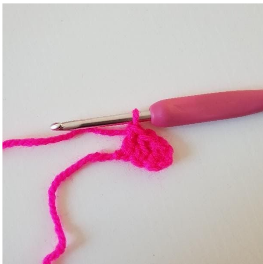
3. Hækl stangmasker i de næste 2 luftmasker. Du har nu lavet din første pixel.